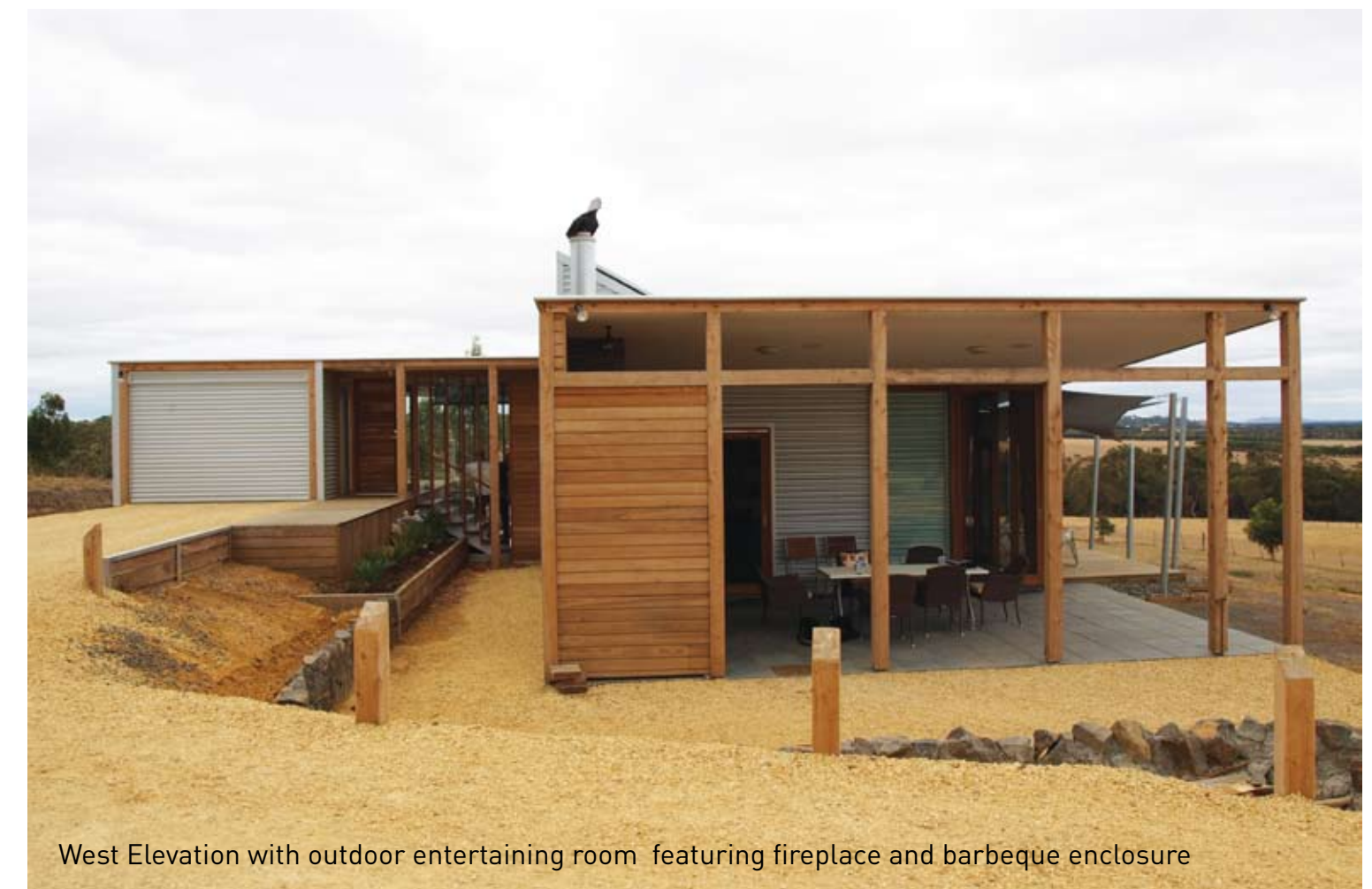
West Elevation with outdoor entertaining room featuring fireplace and barbecue enclosure