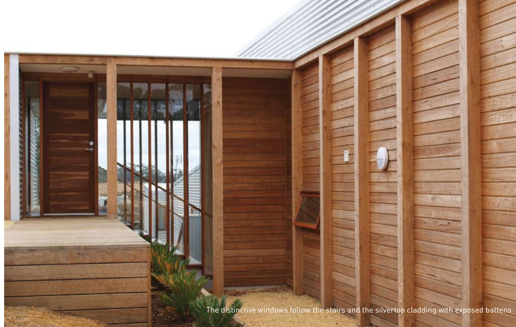
The distinctive windows follow the stairs and the silvertop cladding with exposed battens

Winner: Residential Design – New Houses $300K-$500K Construction Cost Winner: Best Energy Efficient Design – Residential Winner: Best Environmentally Sustainable Design – Residential Winner: Sunpower Design Pty Ltd Phone: (03) 9386 3700 Web: www.sunpowerdesign.com.au